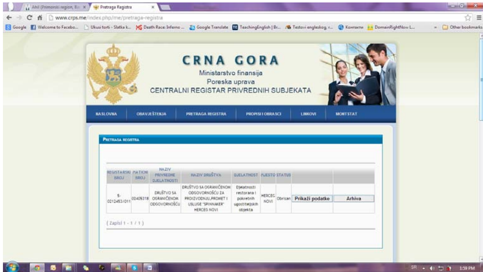
Picture 2. “Presentation of the erased legal entity “Spinnaker” in the browser CRPCSG”; source: http://www.crps.me/index.php/me/pretraga-registra (from 16th March 2013.)

A logical question is “who stands behind such projects and how many of this offers are presented on the site of the National Tourism Organization of Montenegro? Are the canceled legal entities from the central register still charging payments for their cervices and, are they supported for the promotion on the official site of The National Tourism Organization of Montenegro.”